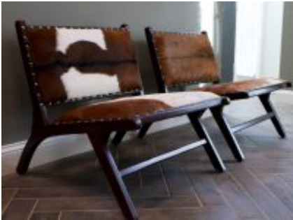
The Most Inspiring Office Decorations Ever