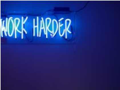
6 Ways Being A Perfectionist Is Hurting Your Career