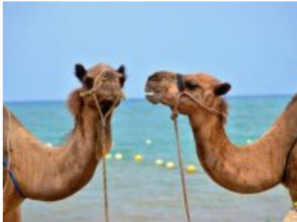
Quiz: What's Your Spirit Animal?