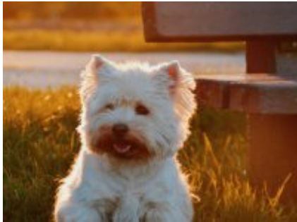
The 5 Best Office Pets In The History Of The Universe!